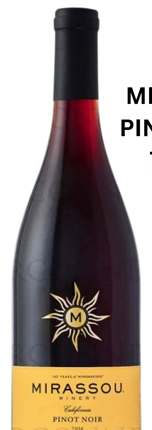
MIRASSOU PINOT NOIR 750ML