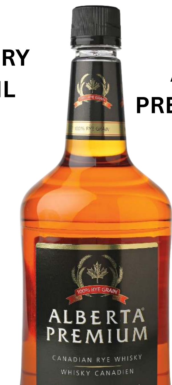
ALBERTA PREMIUM 1.75L