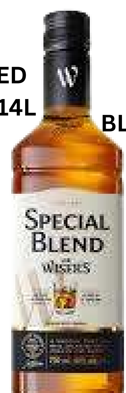
JP WISER SPECIAL BLEND 750ML