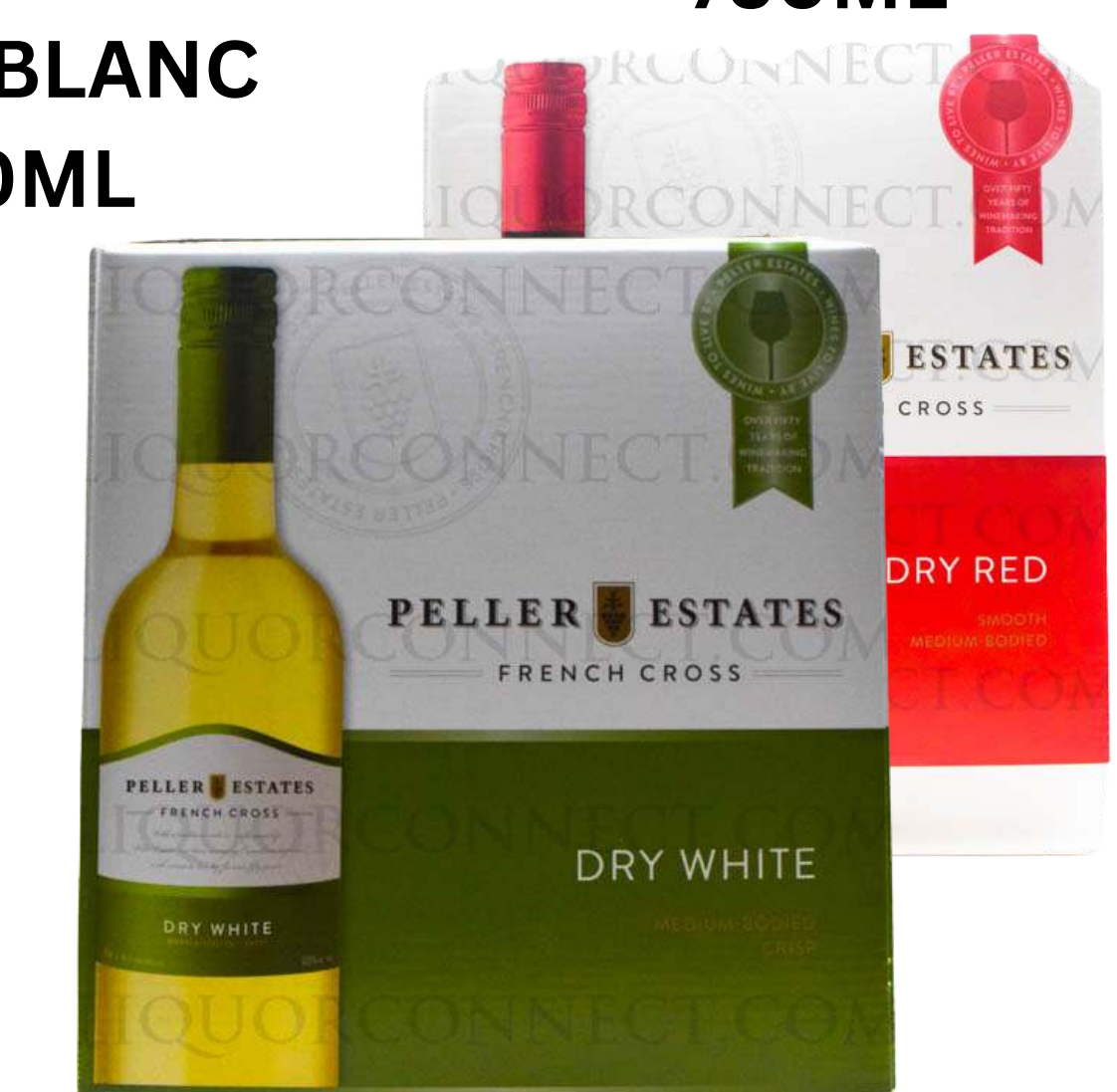
PELLER DRY RED & WHITE 750ML