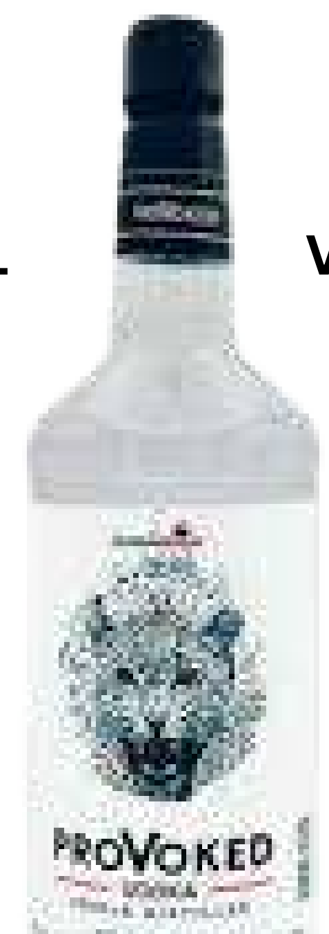
PROVOKED VODKA 1.14L