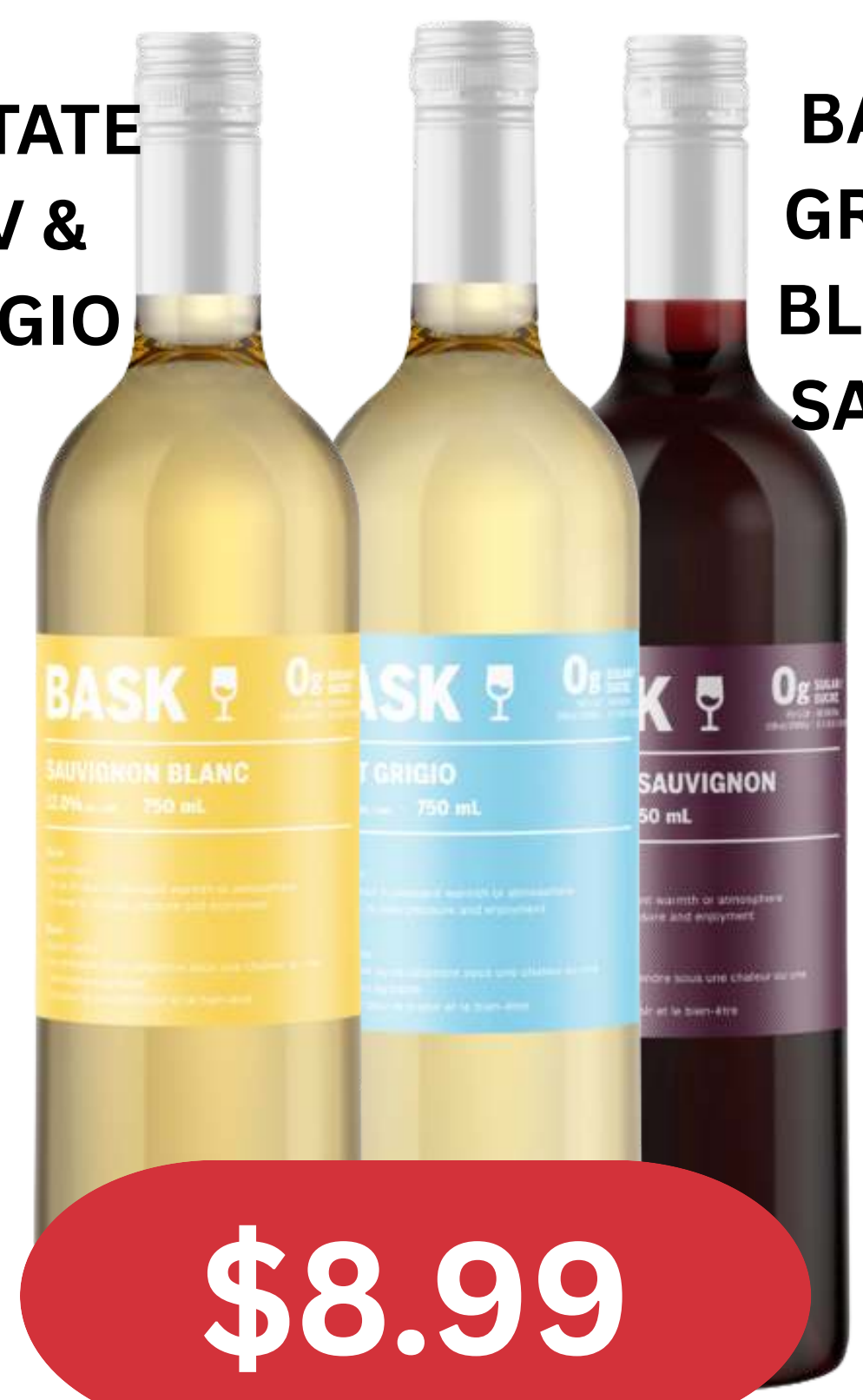
BASK PINOT GRGIO, SAUV BLANC & CAB SAUV 750ML