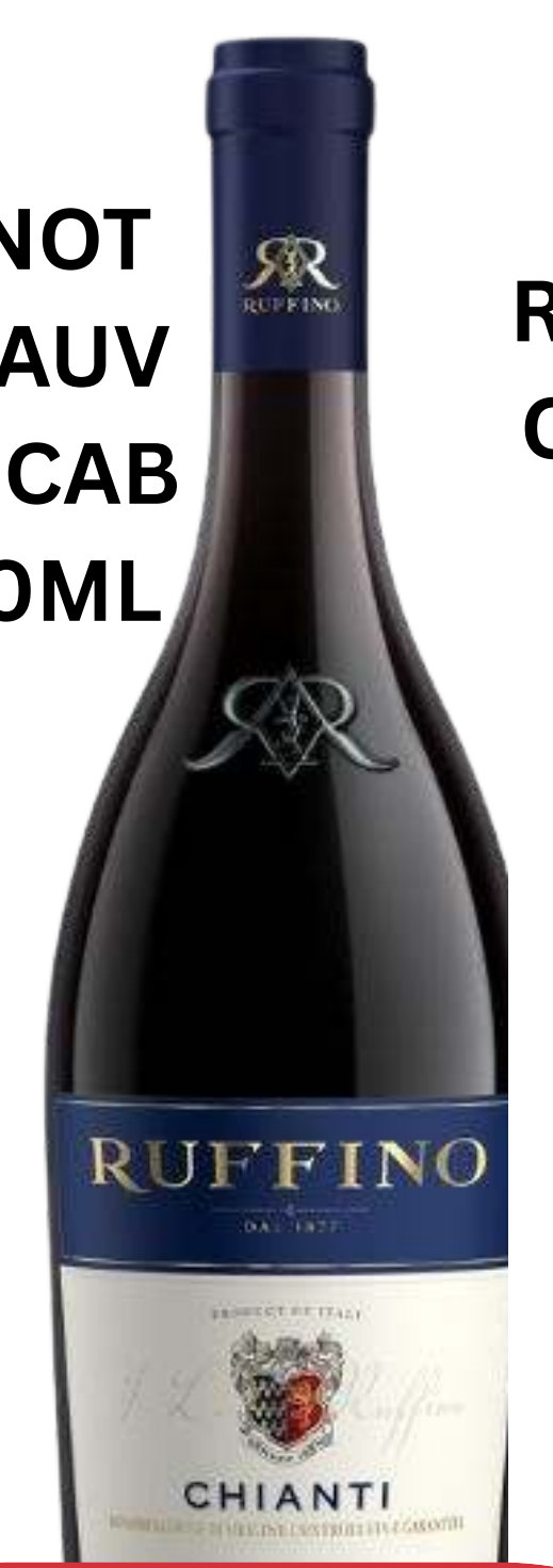
RUFFINO CHIANTI 750ML