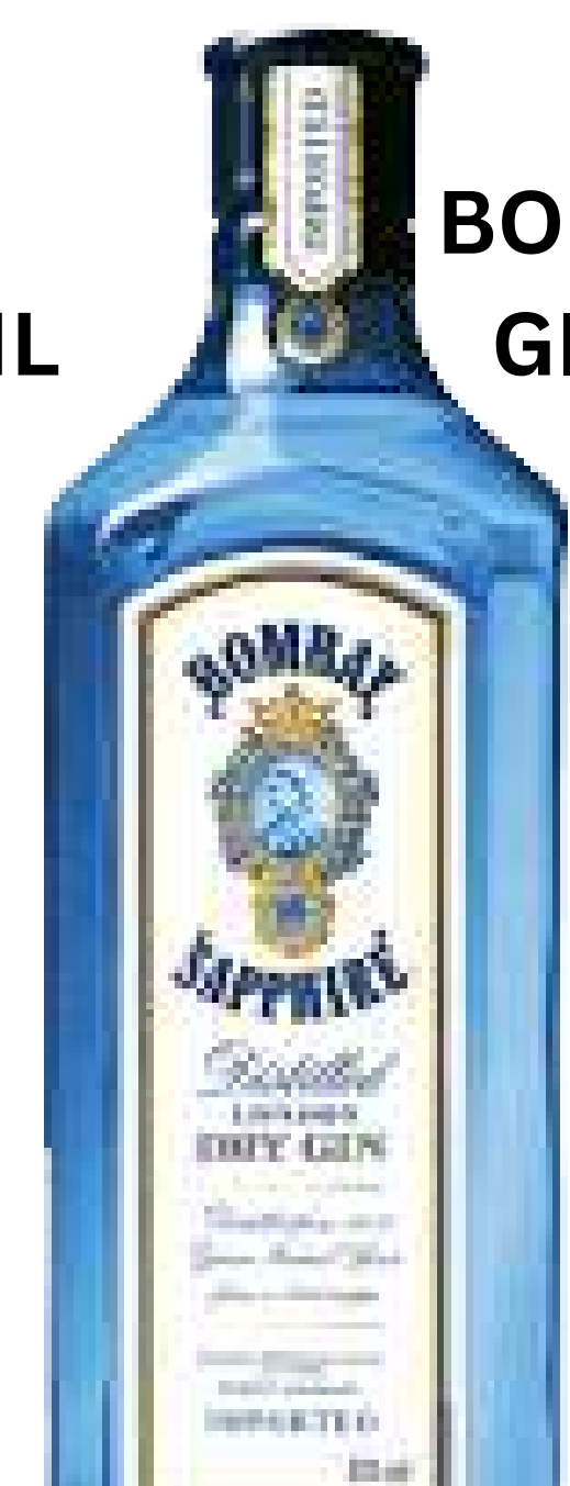
BOMBAY DRY GIN 750ML