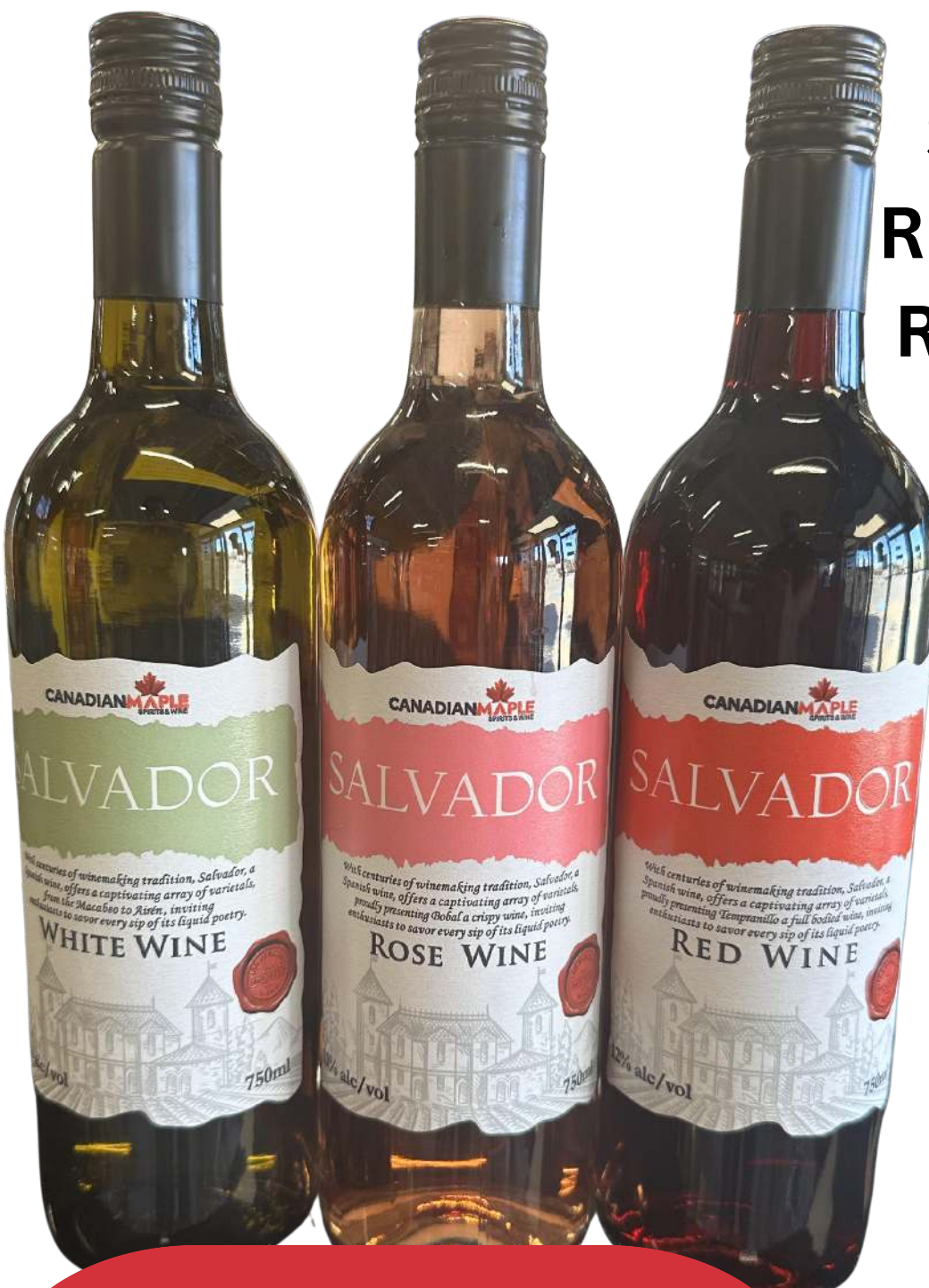
SALVADOR RED, WHITE & ROSE 750ML