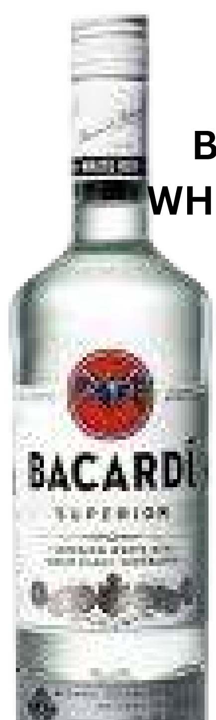
BACARDI WHITE 750ML