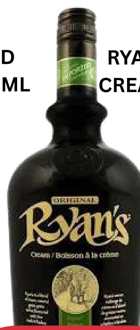
RYANS IRISH CREAM 750ML