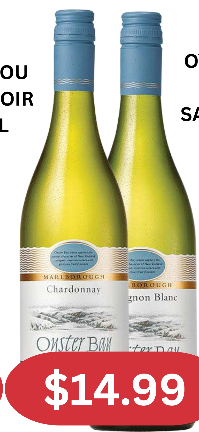
OYSTER BAY CHARD & SAUV BLANC 750ML