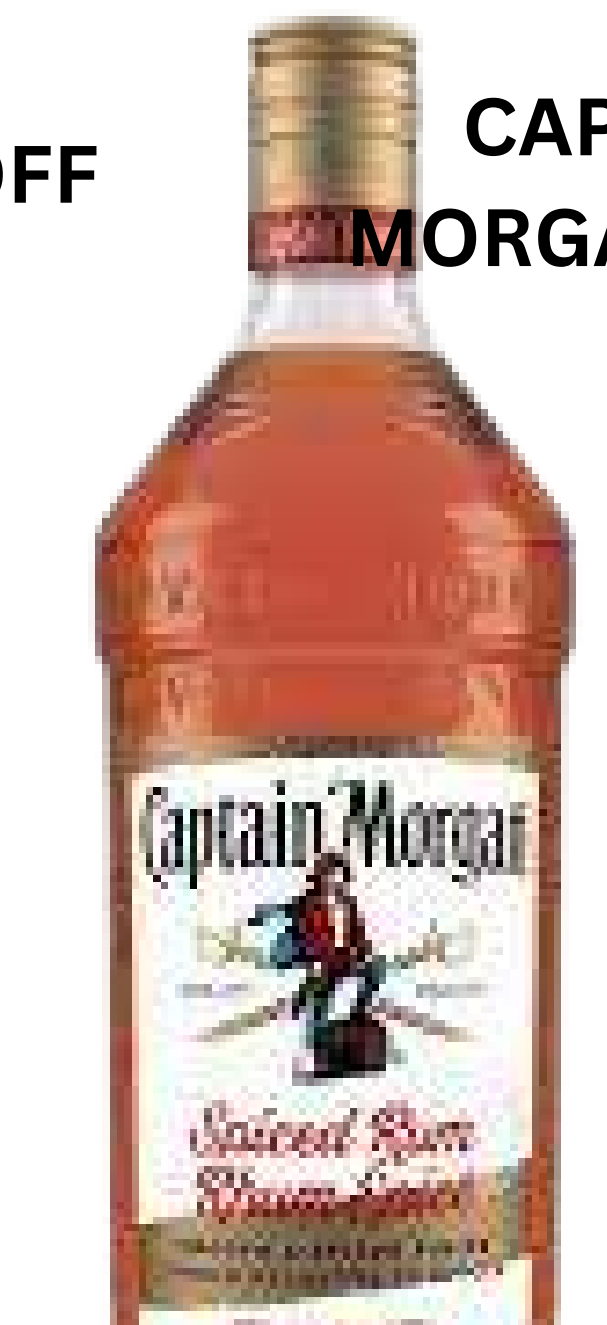
CAPTAIN MORGAN 1.75L