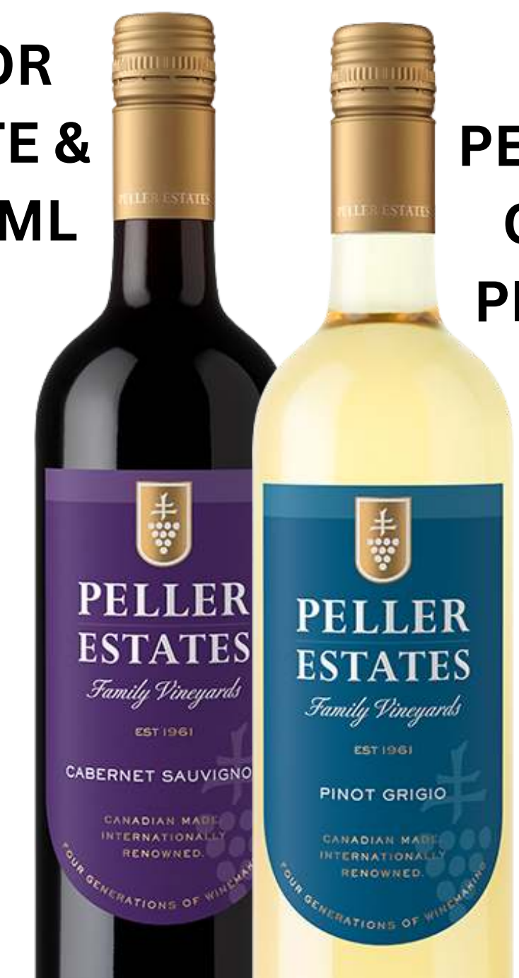
PELLER ESTATE CAB SUAV & PINOT GRIGIO 750ML