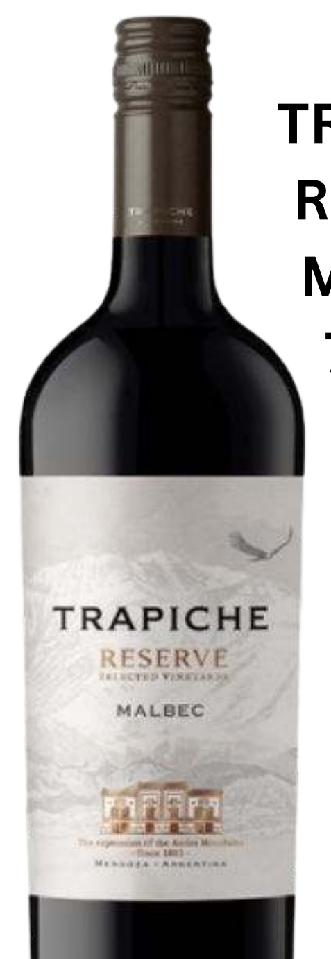
TRAPICHE RESERVE MALBEC 750ML