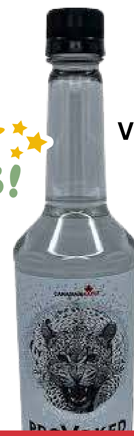
PROVOKED VODKA 750ML